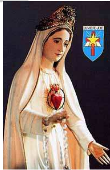
Our Lady, our Star

But, as events happened, the Good Lord showed to L'Oeuvre de l'Etoile that there were other distresses – those of deeply Christian families who sometimes sought in real agony an authentic Catholic education. Thus, still keeping its original vocation of answering to every appeal, the work was led into another recruitment and into the organization of schooling for boys in its house in Nimes. This house is called the 'Sénévé' ("mustard seed"), the little seed in the Gospel, a symbol and a program. And in Lourdes, on the site of the camp, is located another house that