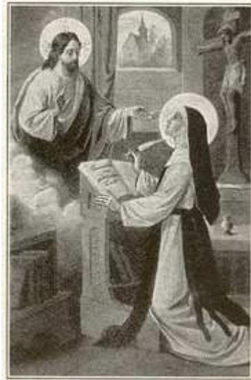
St. Gertrude, herald of Divine love, pray for us

On the Feast of St. Maurice, as the celebrant pronounced the secret words of consecration, St. Gertrude said to our Lord: "Lord, the mystery which Thou dost now operate is so tremendous and so great, that I scarcely dare to breathe or speak. It is enough for me to hide myself in the deepest valley of humility which I can find, expecting my share in the salvation which Thou dost there impart to Thine elect." Our Lord replied: "When a mother wishes to do some work with pearls and precious stones, she sometimes places her child in an elevated place to hold her thread or her pearls or to do her some other service. So I have placed you in an eminent position to dispose of the merits of this Mass. If you elevate your will even to desire willingly to suffer all kinds of labour and pain in order that this sacrifice, which is so salutary for all Christians, whether living or dead, may be fully accomplished in all its excellence, you will then have contributed, according to the extent of your ability, to the accomplishment of My work."