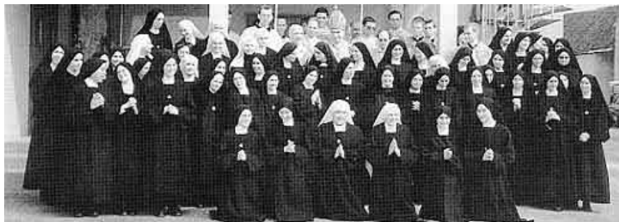
Quasimodo Sunday 1986: The Sisters with their Founder after the taking of the Habit