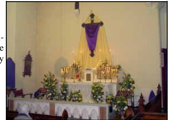
Altar of Repose for Holy Thursday at St John's Church in Dun Laoghaire