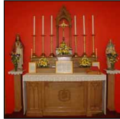
The Main Altar in Newry for Easter Sunday

are also talks of a pilgrimage to Lourdes in the summer 9th to 17th July 2006.