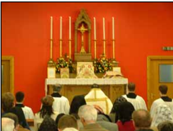
The Main Altar in Newry

It is the host of the Youth Meetings that take place every two or three months. On