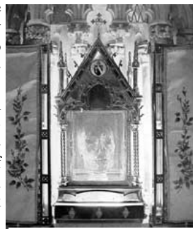
Head\ of\ St\ Oliver\ in\ Drogheda