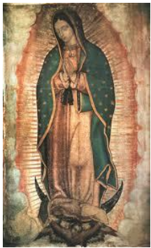
Friday 7 th December The Vigil of The Immaculate Conception