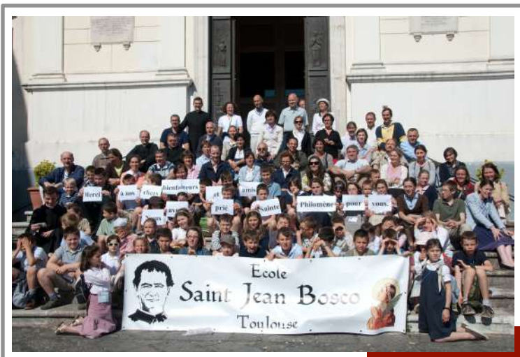
Shrine of St. Philomena, Mugnano 2011

Both in Toulouse and Armada, St. Philomena's patronage was astounding in its speed and efficacy. Despite the doubts, the frustration and fatigue, even despair in the face of the sheer magnitude of our undertaking, St. Philomena never wavered in her intercession and protection. I tell this story in order to engage and encourage all the support we can muster for Operation Philomena. The assurance of past blessings and the pressing need of our present endeavour will help every reader to understand the necessity and usefulness of supporting our new Operation Philomena. The Curé of Ars' favourite saint will not fail to bless us if we are faithful to her. I write this story in a spirit of immense gratitude to a saint who answers desperate prayers with overwhelming generosity, to whom I pray that our parish and school will be indebted for many years to come.